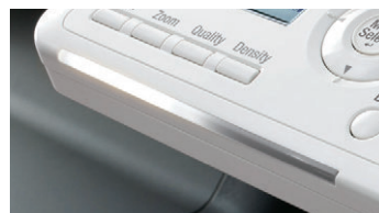
LED Status Display