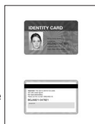
ID Copy Function

The bizhub 185e/165e is a full-featured 3-in-1 MFP designed to meet printing, copying and scanning needs, yet be simple and intuitive to use. The operation panel features a Shortcut key, which can be freely assigned to one of four commonly used copy functions (Combine Original 2-in-1, Sort, Erase, and Book Separation), as well as an ID Copy key for copying both sides of small-sized documents to one page, function keys for instant access to print settings, numeric keys and a reset key. A unique LED Status Display and clear Error Status Indicator offer at-a-glance visual feedback even from a distance, while LED-backlighting ensures a bright, readable display. Routine maintenance tasks and paper replenishment have also been simplified to minimise downtime and maximise productivity.